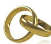
Marriage / Civil Partnership