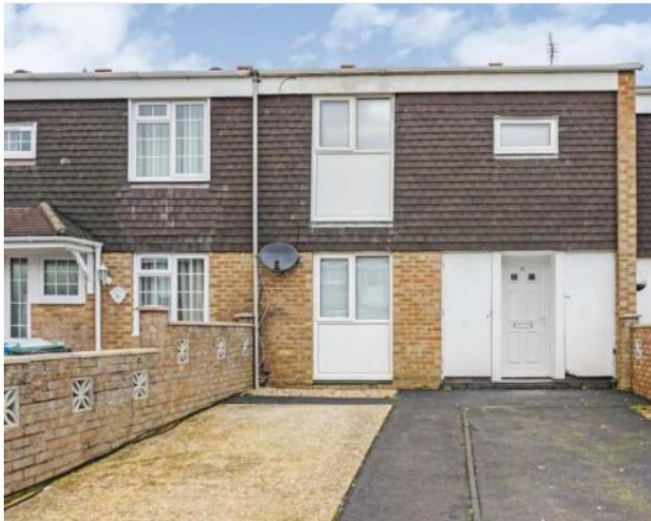
2 bedroom terraced house for sale Mercury Close, Lordshill, Southampton, SO16