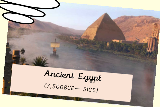
Ancient Egypt (7,500BCE – 51CE)