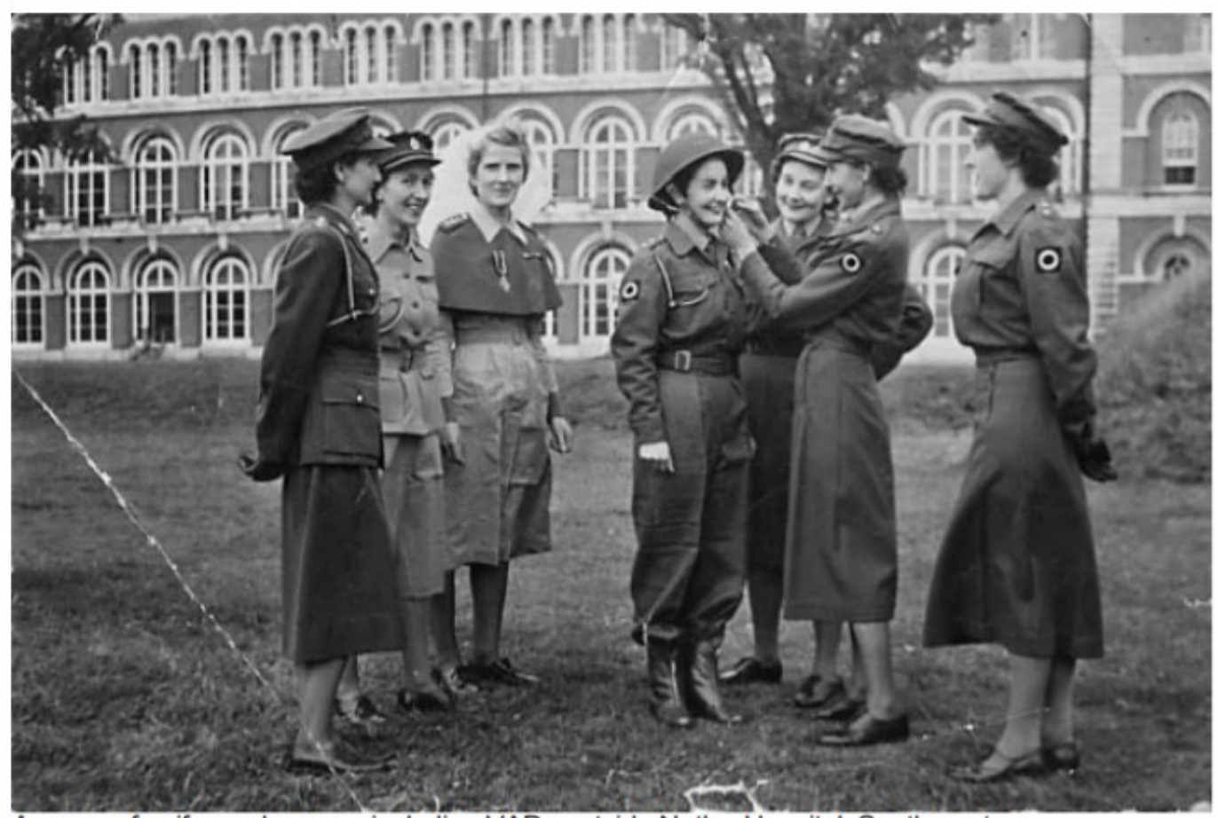
A group of uniformed women including VADs outside Netley Hospital, Southampton HRO: 92M91/69/4