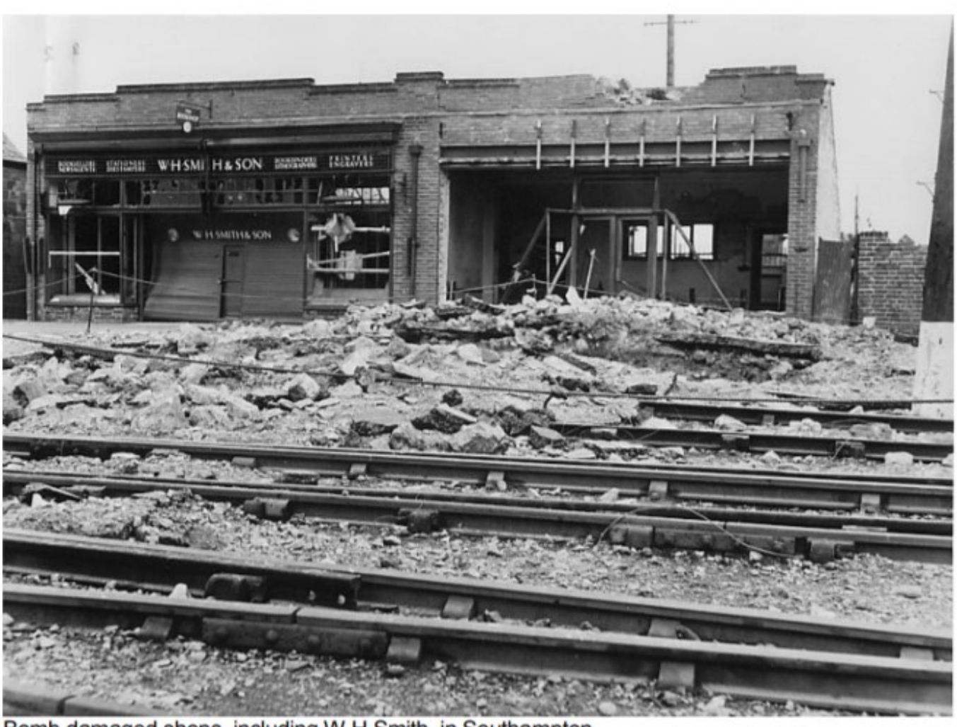
Bomb damaged shops, including W H Smith, in Southampton 139M86/12/1