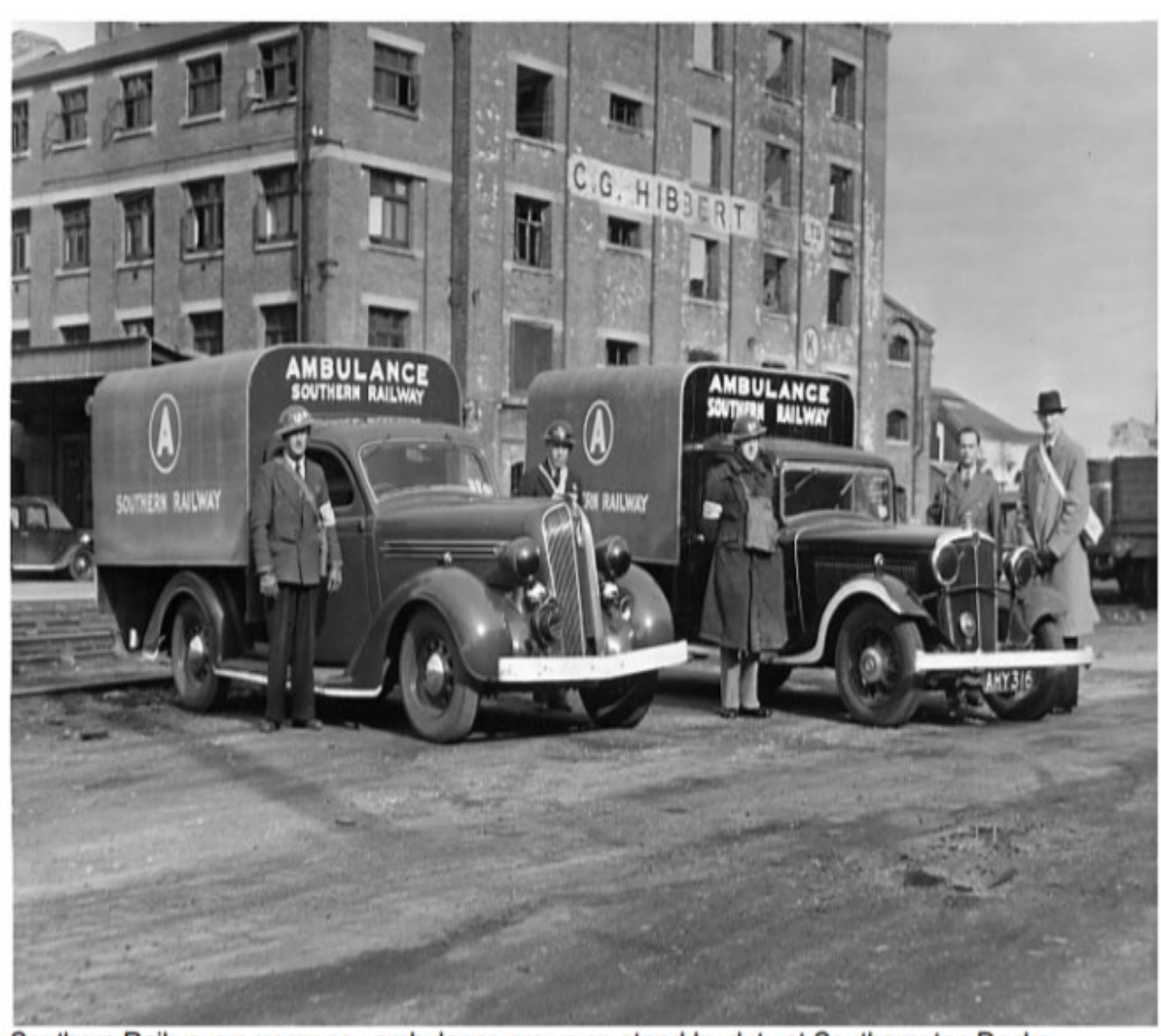
Southern Railways emergency ambulance crews on stand-by duty at Southampton Docks HRO: 139M86/8/2