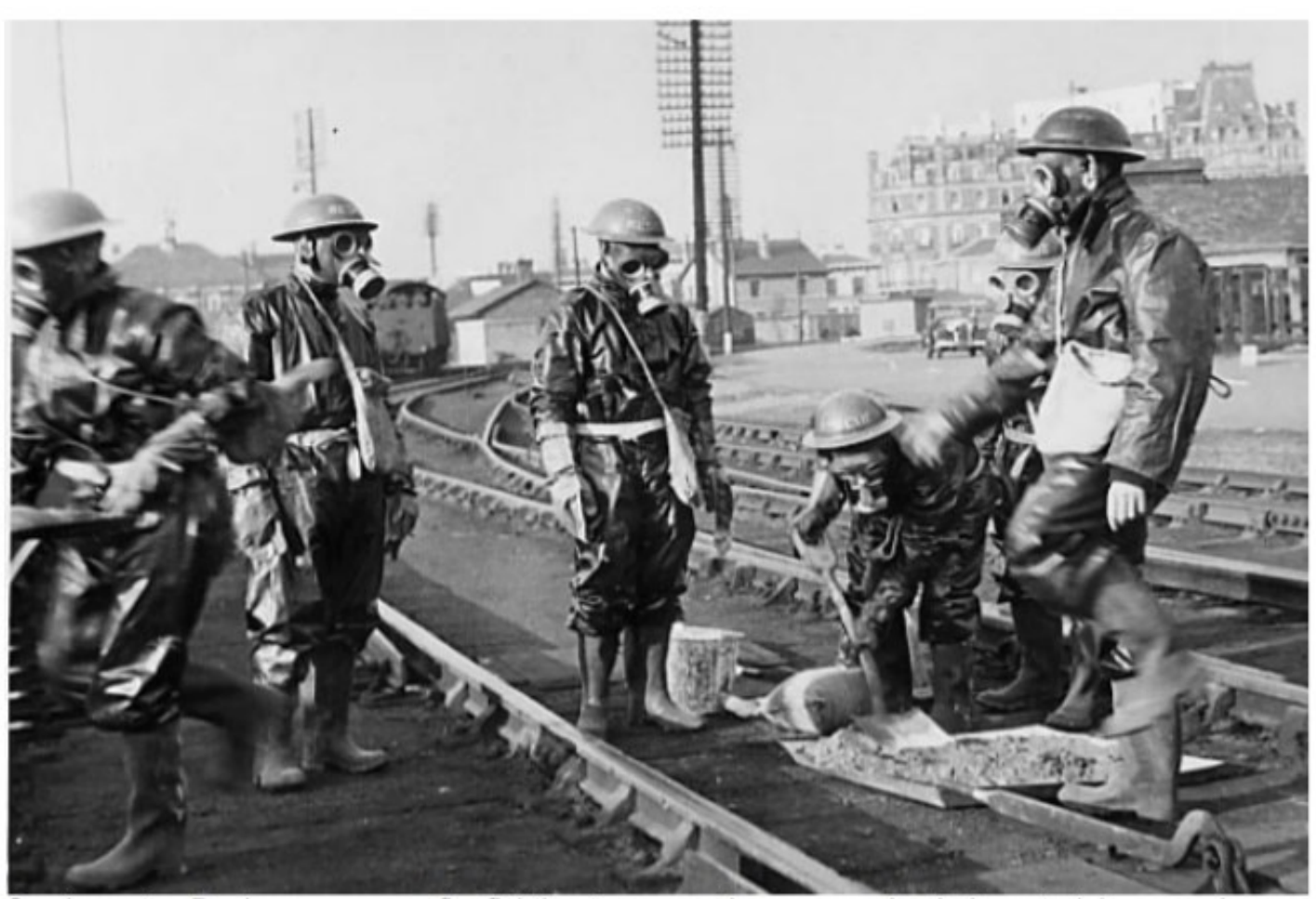
Southampton Docks emergency fire fighting team wearing gas masks during a training exercise HRO: 139M86/65/2