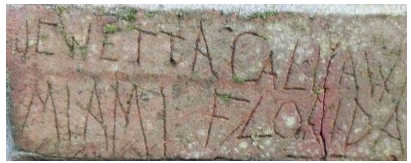
A wall near Southampton docks which is still standing today. These carvings are from 1944.