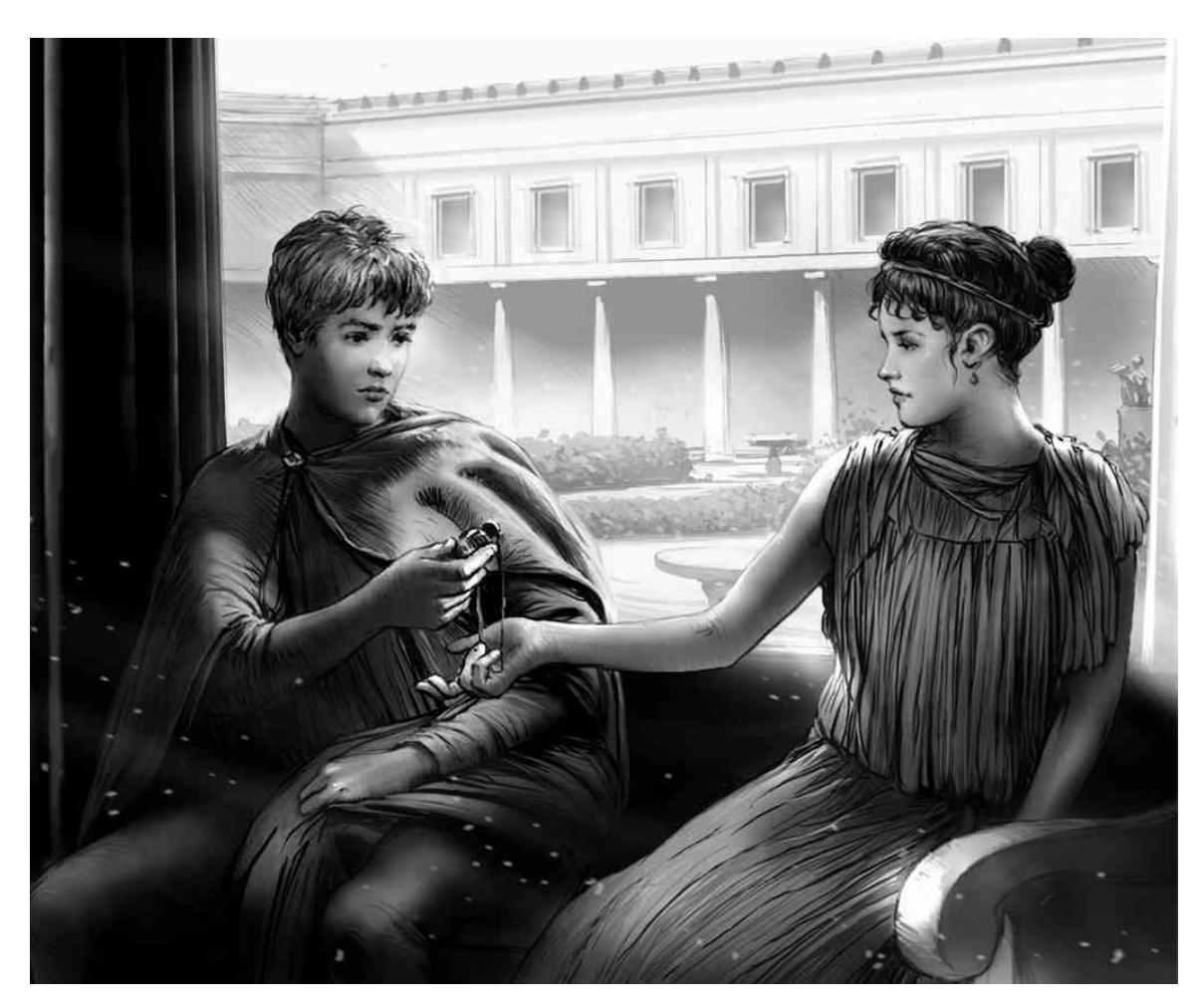
Finn knew she was right but it felt very strange as he pulled the bottle from around his neck and handed it over...

"Finn, you have played your part. Now give me the poison and get back to your brother. What do you think my uncle's plans will be for you now that he thinks you've done his dirty work? He's ruthless Finn, he kills anyone who is a threat..."