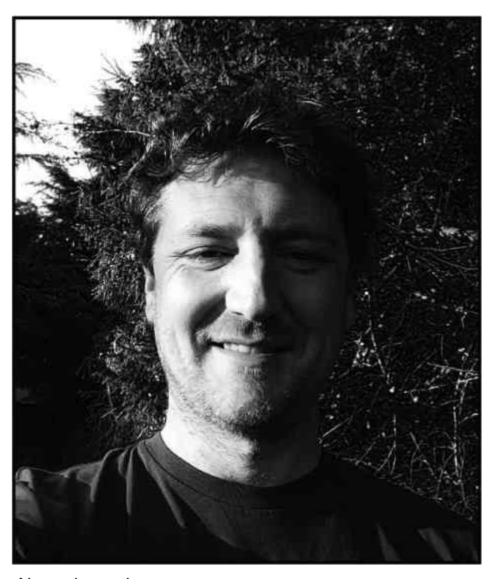
About the author

Growing up in London I spent a lot of time sitting on the Underground, daydreaming and reading books. Historical adventures in far-flung lands were always my favourite and I used to love visiting castles and ruins.