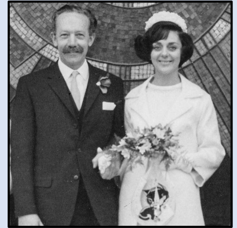
Captain Sir Tom Moore on his wedding day