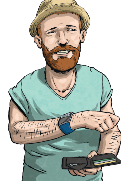
You should never say the word 'gay'.' Do you agree or disagree with this statement? Why?